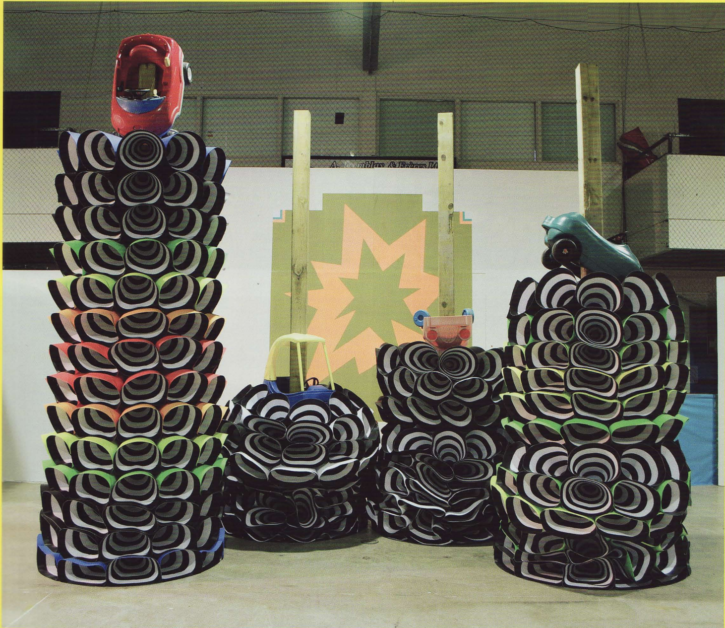
Screenprinted paper, lumber, plastic toys, 304,8 x 487,6 x 365,7 cm.